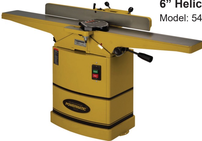
6" Helical Head Jointer Model: 54HH