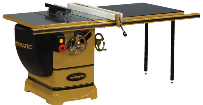
10" Table Saw 5HP Model: PM2000