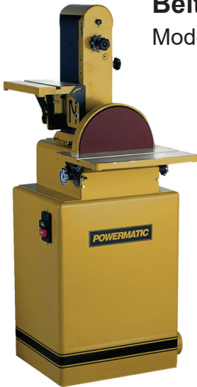
Belt/Disk Sander Model: PM31A