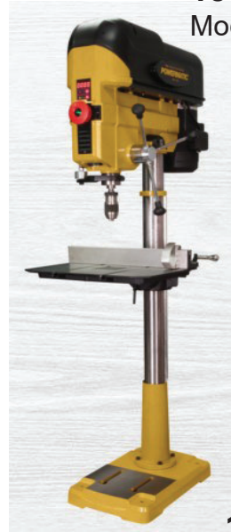
18" Drill Press Model: PM2800B