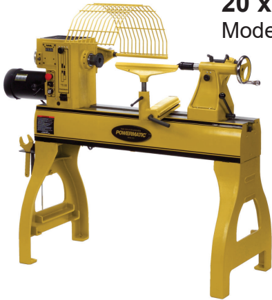
20 x 35 Lathe Model: PM3520B